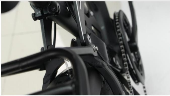
A26. The two holes on the upper part of the seat stay