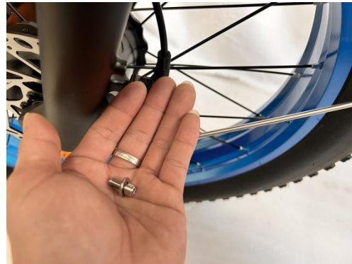
A21.Stick the screw on the lock