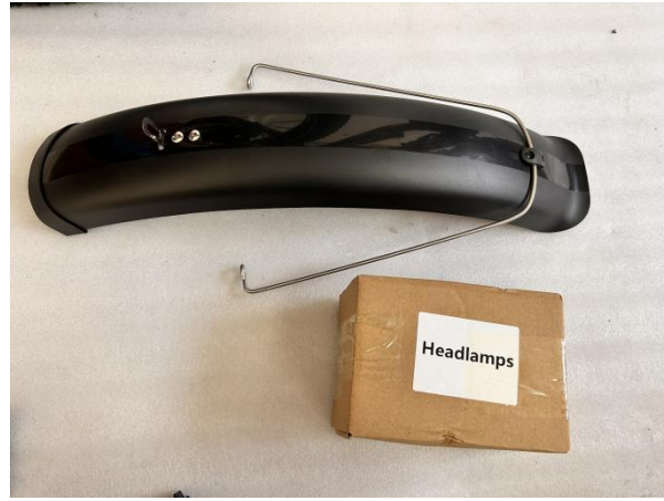
A19.Fenders and headlights