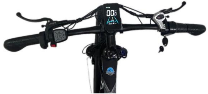
A38. The installation is complete