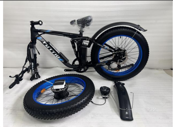
A02. Remove the packing EPE pearl cotton