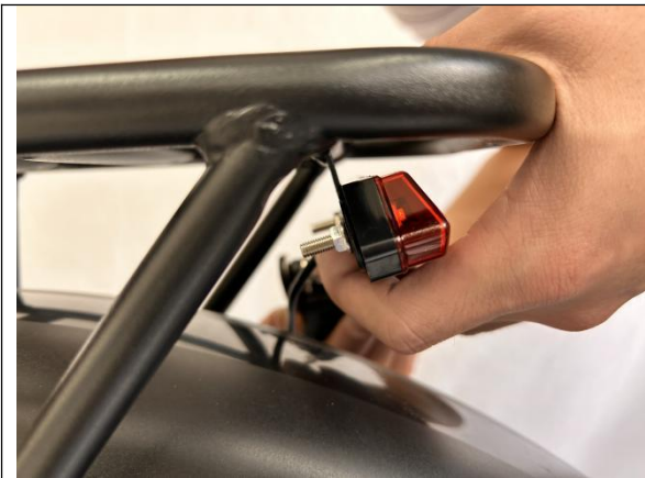
A32.The taillight is placed on the shelf support