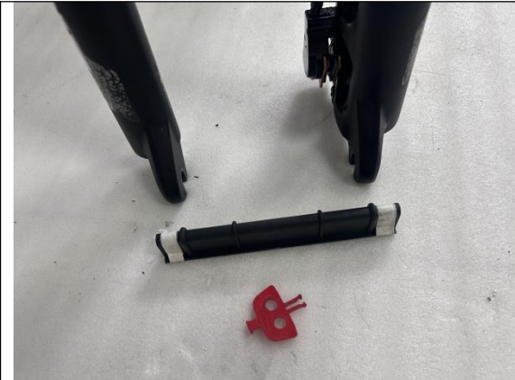
A13. Remove the fork spacer. (it protects the fork from crushing and deformation during shipping, it is not a part of the bike )