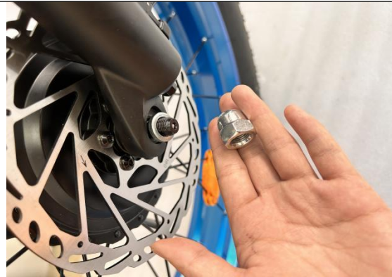
A16.Put the gasket first, then the nut