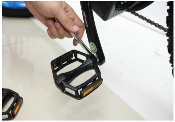
A30. Turn spanner counter-clockwise to fix the pedal L on the left side