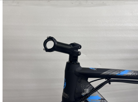
A04. Turn the stem forward ( do not turn the whole fork )