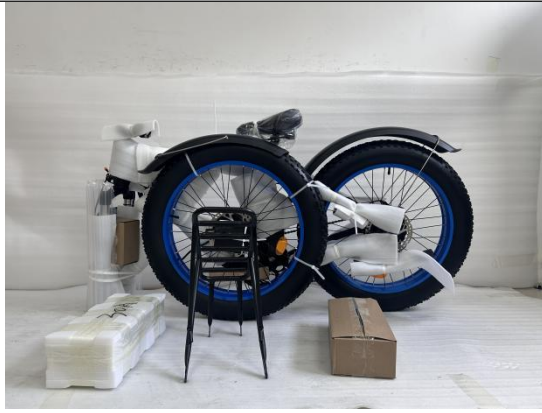
A01. The Packaging of the e-bike