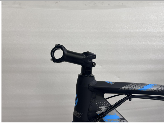
A05. The correct direction the stem should be facing