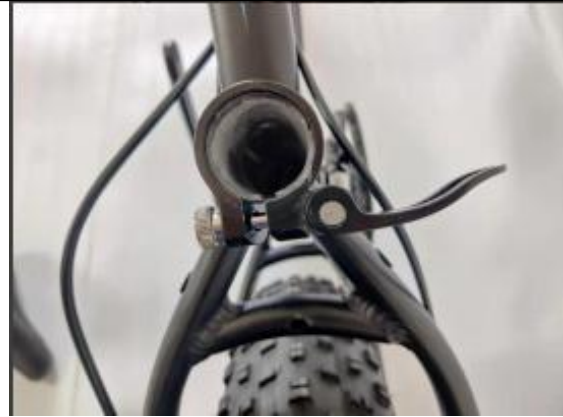
A23. Open the lever and turn the nut to loose theseat post clamp