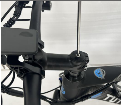
A11. Tighten the top bolt