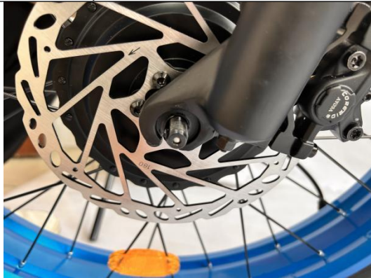
A15. Put the front wheel on the fork