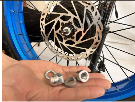
A14.Remove the front wheel screws