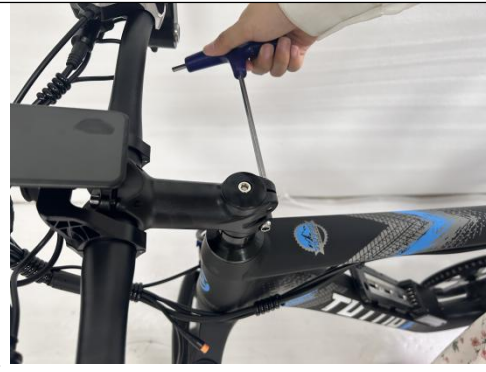
A10. Turn the 2 bolts on both sides to tighten the stem