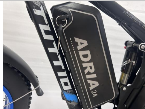
A37. Push the battery downward to install it tightly