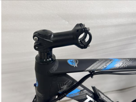
A03. The arch of the fork should be facing forward