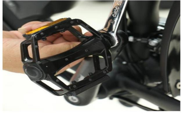
A31. Turn the spanner clockwise to fix the pedal R on the right side