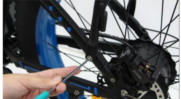
A29. Tighten the 2 lower bolts on both sides