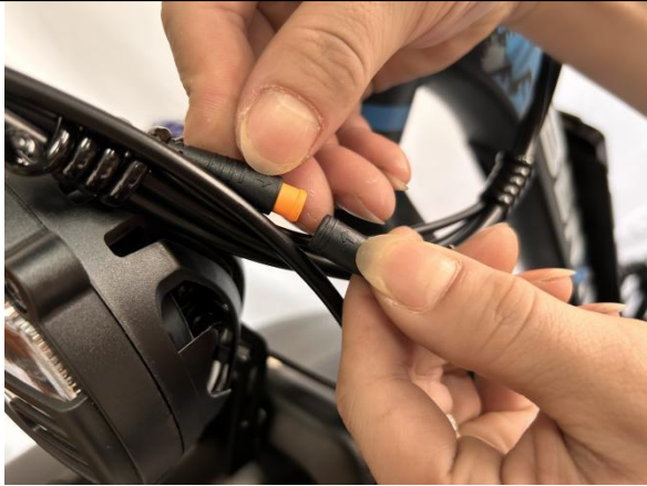
A22 Link the interface arrow on the headlight to the arrow.