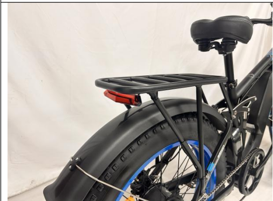
A34.Tie the thread with a cable tie