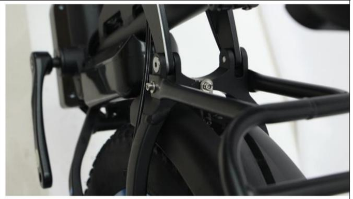
A27. The rear rack may need to be adjusted