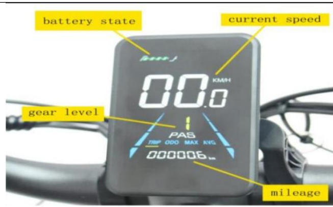
A40. LCD Display: battery status. real-time speed. Speed grade. Mileage traveled