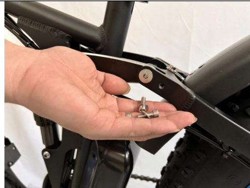
A25. Remove the shelf screws.