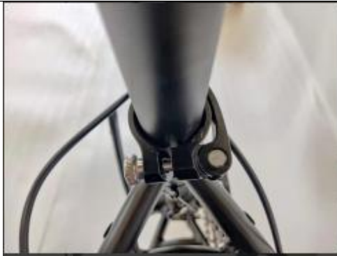
A24. Insert the seat post into the seat tube