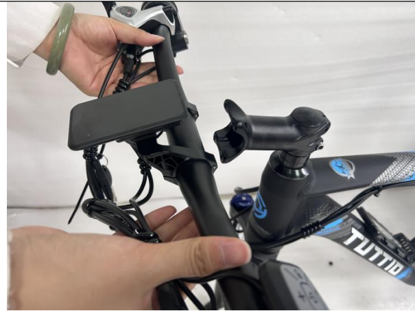
A07. The correct orientation of the handlebar