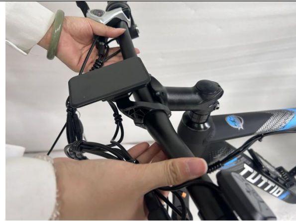
A08. Fit the stem and handlebar together