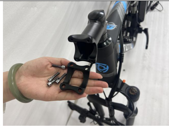
A06. Remove the 4 bolts