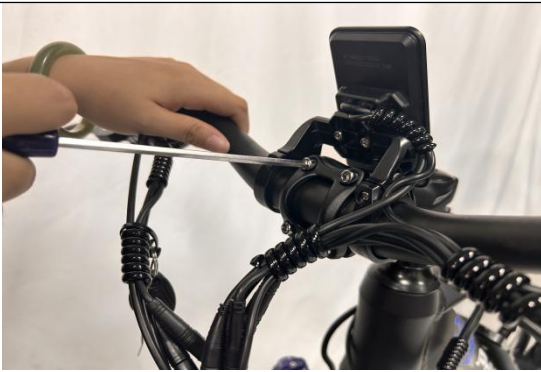
A09. Tighten the 4 bolts to fix handleba