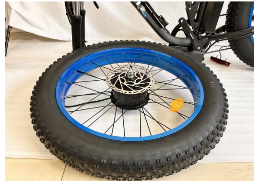
A12. Ready to install the front wheel