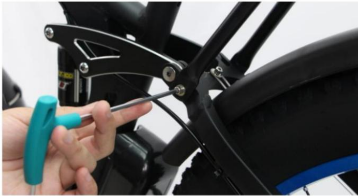
A28. Tighten the 2 upper bolts on both sides