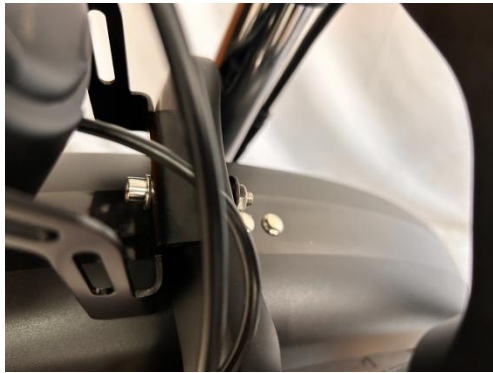
A20. Use the bolt to join the headlight, fork arch and fender