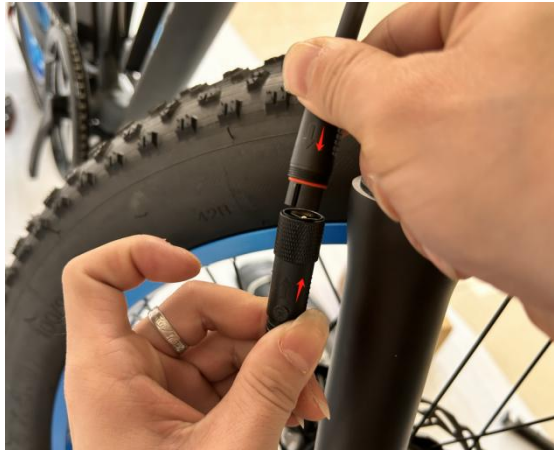
A18.The front motor line should be arrow-aligned