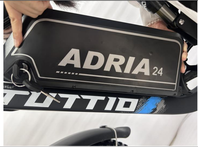
A36. Put the battery on the battery base