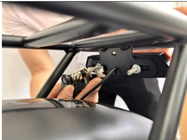
A33Lock the screw